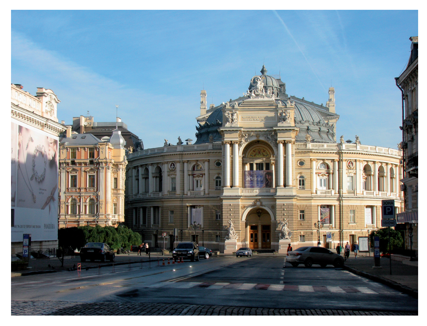
Odesa Opera House, central facade

Architecture Conference. To this day the square has hardly changed at all. A completely original hundred metre wide street of the same architectural style links Ekaterina Square to the Duke de Richelieu monument and the famous Potemkin Steps. It all appears to be a single architectural ensemble.